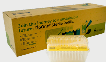
Environmentally friendly cardboard box

Refills providing a plastic saving of 63% compared to the racked equivalent